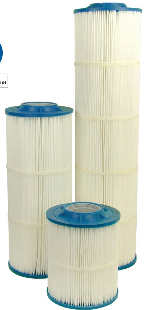
Premium Hurricane® Polyester Cartridges